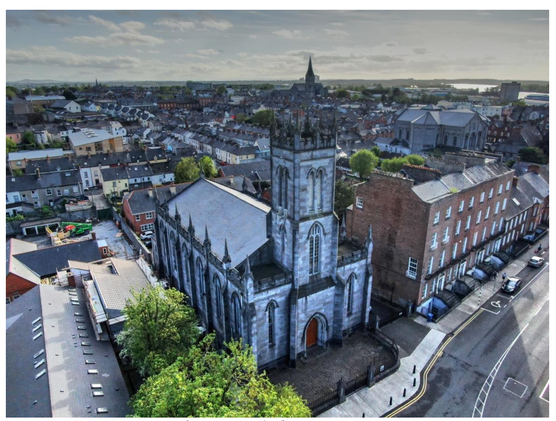
Saint Michael's Church, Limerick