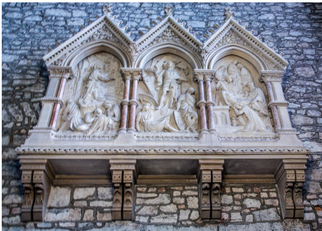
Reredos in the Chapel of Ss James & Mary Magdalene, Saint Mary's Cathedral

THE SECOND SUNDAY BEFORE LENT 7 TH FEBRUARY 2021