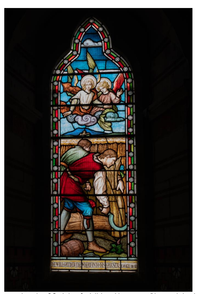
Window in church of Ss John & Ailbhe, Abington.