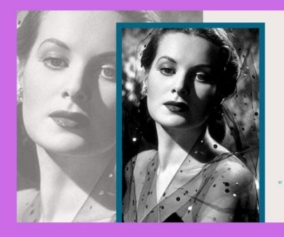
Saint Mary's Cathedral Lunchtime Lecture Series Tuesday 2nd February 1.15pm

LUNCHTIME LECTURE SERIES - FEBRUARY 2021