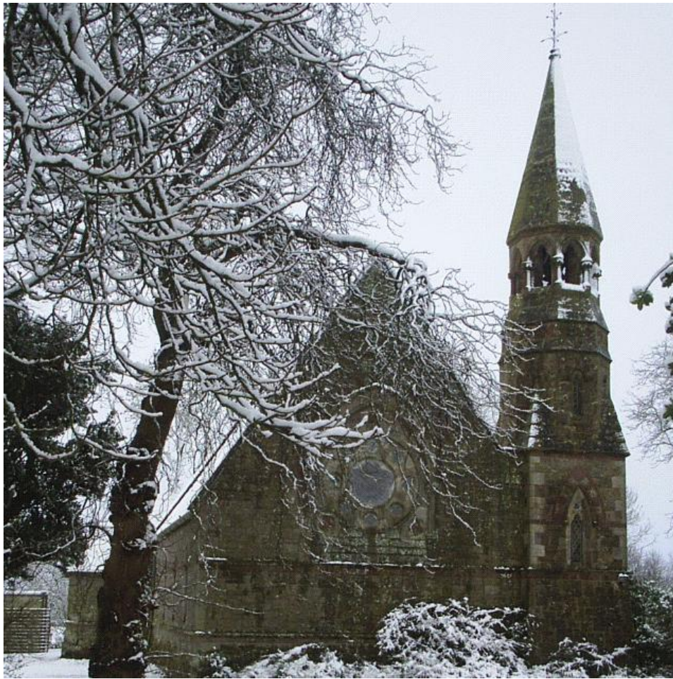
Church of Ss John & Ailbe, Abington

THE FEAST OF THE PRESENTATION OF OUR LORD IN THE TEMPLE (CANDLEMAS) 31 st JANUARY 2021