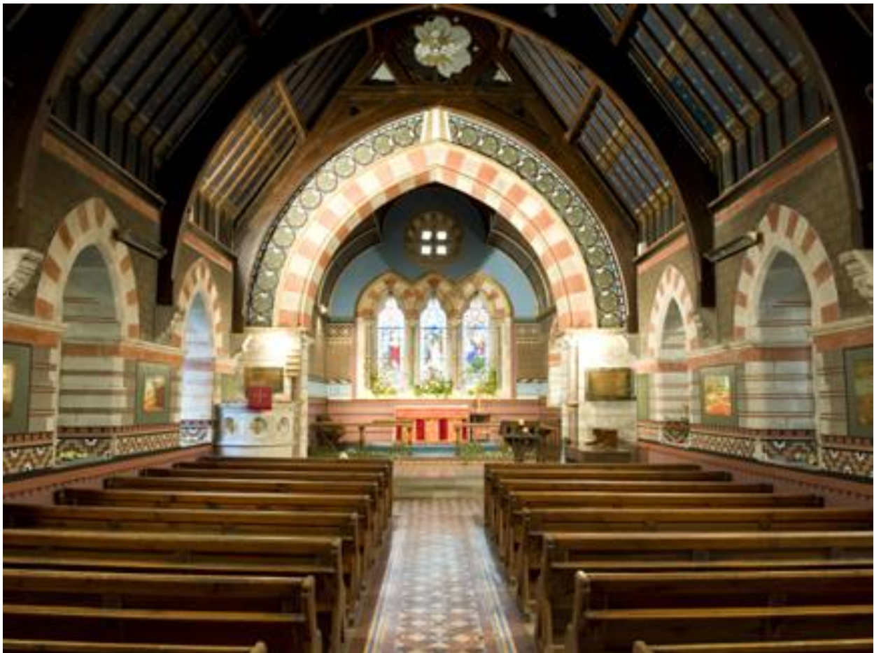
Saint John's Church, Abington