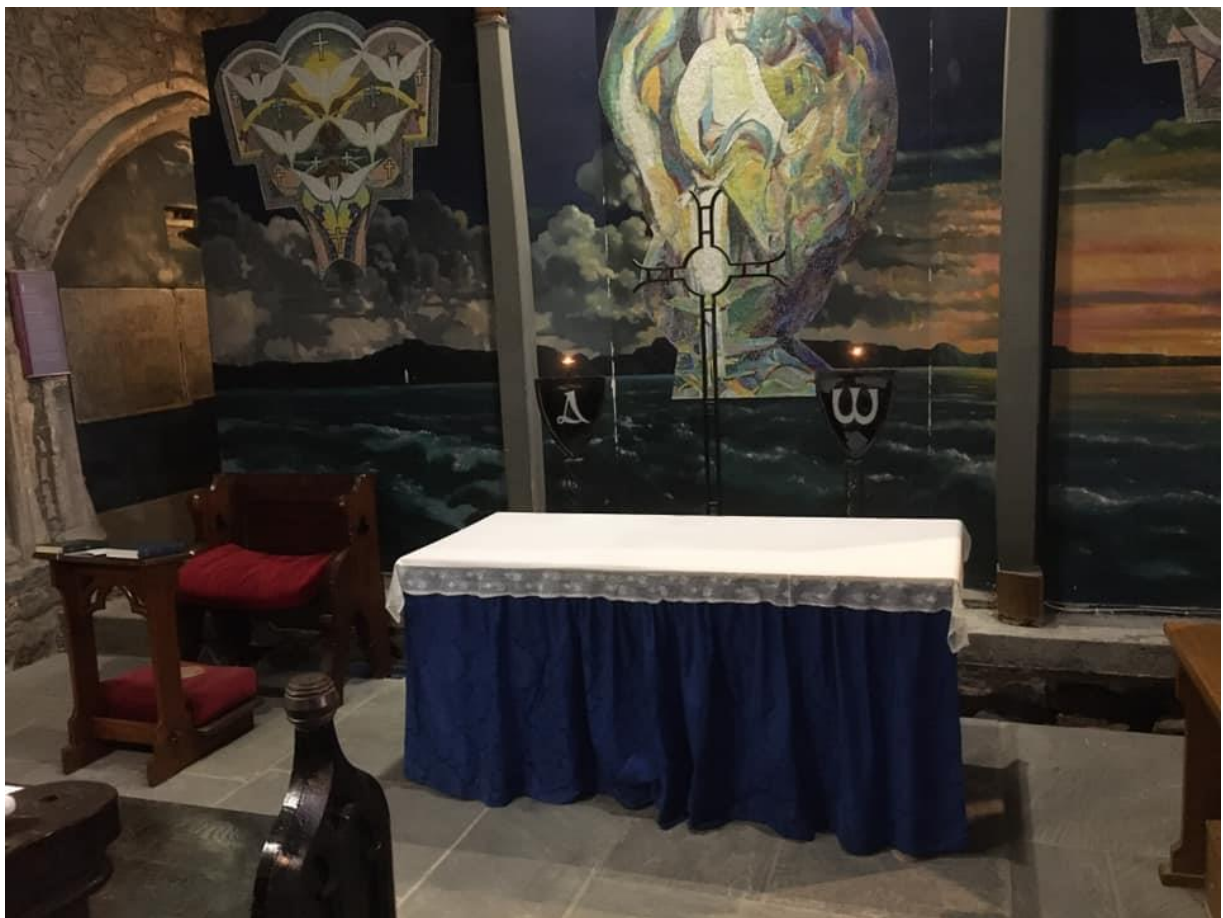
The Chapel of the Holy Spirit, Saint Mary's Cathedral